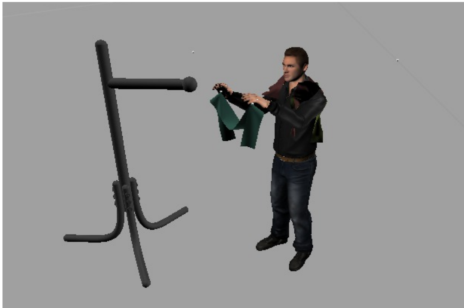
Figure 2: Character wearing two scarfs and trying to put on another one.